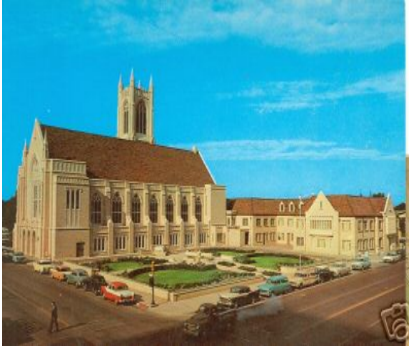
First United Methodist Church Lubbock

The 2010 Annual Meeting of the Texas United Methodist Historical Society will be held March 26/27 at First United Methodist Church in Lubbock. The meeting will be a special one because it will celebrate the centennial of the division of the old Northwest Texas Conference into the Central Texas Conference and the present Northwest Texas Conference in 1910. The approaching centennial has created quite a stir in both conferences. The NWT Conference has already published a centennial history (see related story), and the CT Conference expects to have one ready next year.