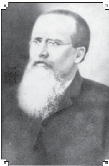
Bishop Atticus G. Haygood*