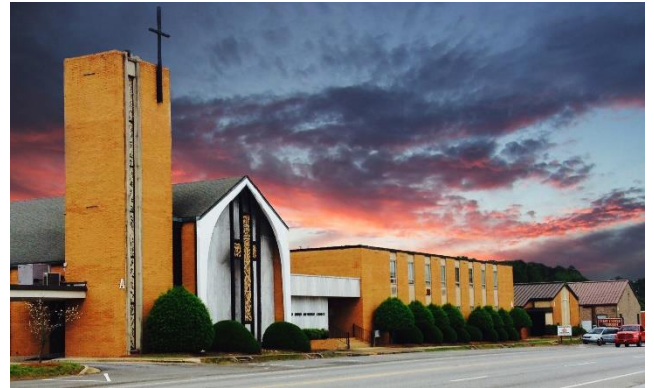
First United Methodist Church and the city of Warner

Robins have undergone many changes through the years. The history of the church reflects the history of the community. First Methodist played instrumental roles in the formation of other Methodist churches in the community, including Northview, Trinity, Centerville, and Christ. First Methodist has sponsored a church bazaar/marketplace since 1968, flea markets since 1990, and consignment sales since 2011. They organized the first church-sponsored Boy Scout troop in 1956, opened the first weekday preschool and kindergarten (Cheerful Cherubs) in September 1950, televised worship services since July 1974, installed the city's first pipe organ in 1980, opened the doors to a clothes closet from 1971 until 2013, provided food for families through a food closet from 1983 until the opening of the food pantry in 1991, fed the hungry in the soup kitchen since August 1990, and provided shelter and support to families since 2010.